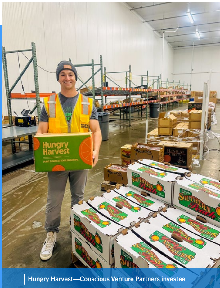
Hungry Harvest—Conscious Venture Partners investee

Wealth-Building Loop: Partial loan interest is reinvested back into the cooperative to explore and support long-term economic resilience.