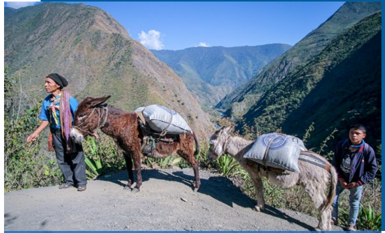
Café Orígenes—SK2 Fund direct small business loan

Multi-year Investment Partnership: 3-year commitment allows business to plan ahead knowing they have the funding needed.